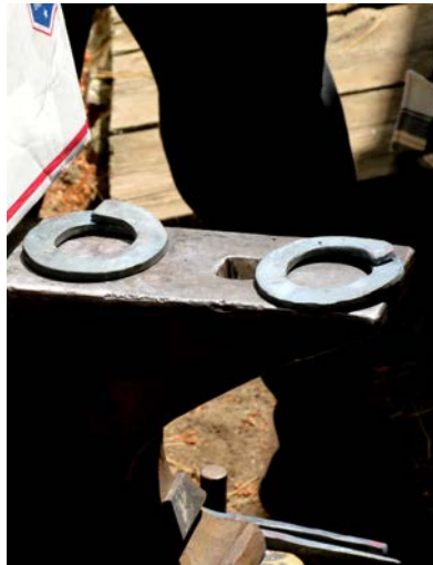
A couple of the rings.