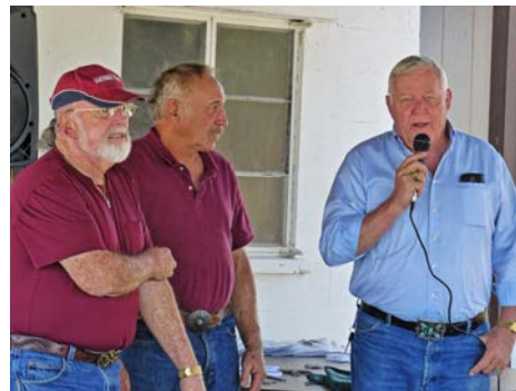
Recognition for service to the organization