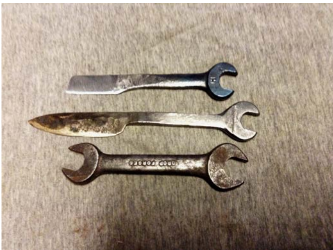
Utility knives made from old style wrenches. Made from mid-carbon steel? Spark test shows that some are cast steel.