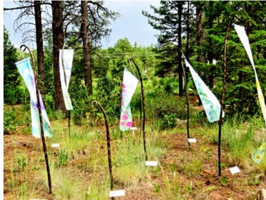
Sprouts by Cathi Borthwick