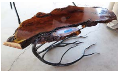
Some of the great items that were auctioned off last year.