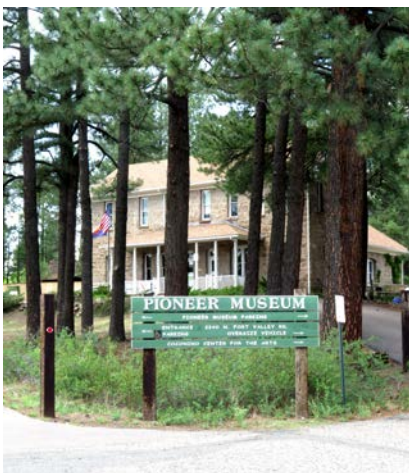
Our demo was off to the left of the main Museum building.

All in all, this was an enjoyable, informative day.