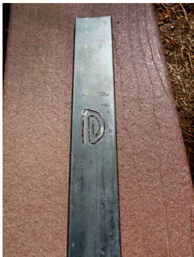
Dief's hand engraved touchmark.