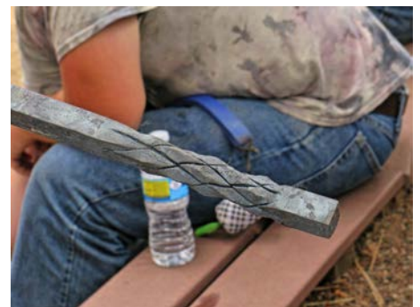
Completed pineapple twist.