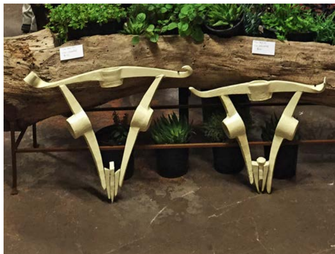
Found Object Art - Steer Skulls Ira Wiesenfeld

4200 N. Oxbow Road, Tucson, AZ 85745 520-603-2703