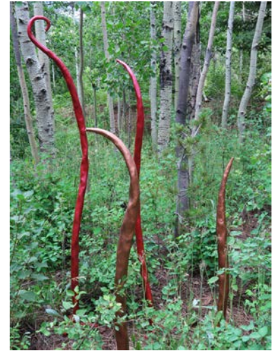
Growing Wild by Cathi Borthwick