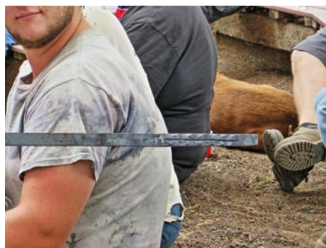
Early state of a pineapple twist.