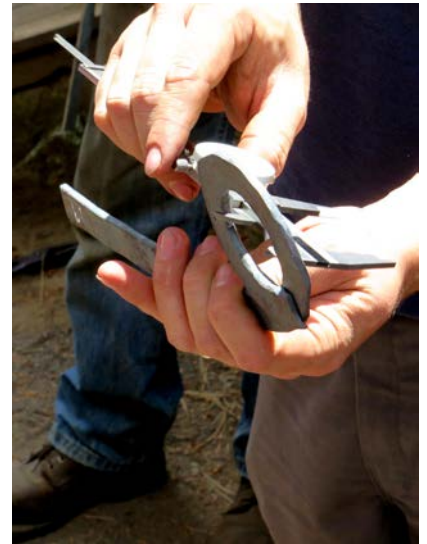
Checking the dimensions.