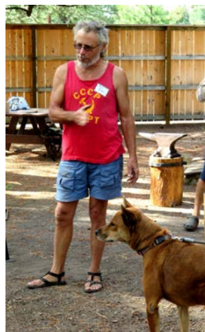
Dief discussed touchmarks -- with a little help from Swage.