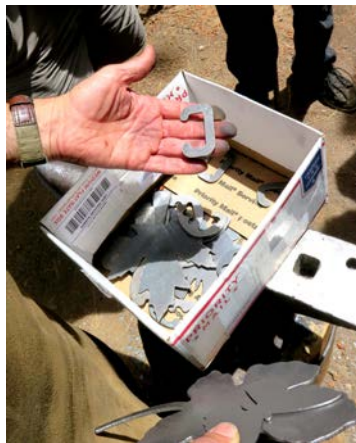
Some of the prizes.