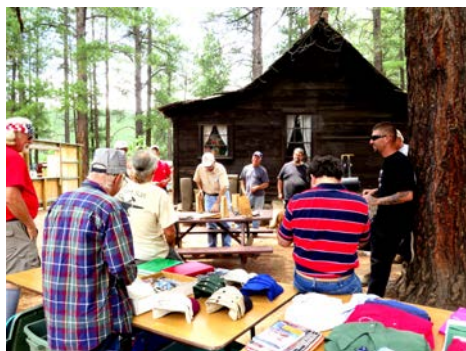
Iron in the Hat