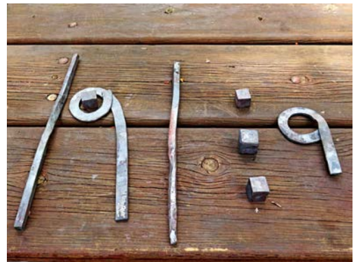
Not top-of-the-line, but not bad.