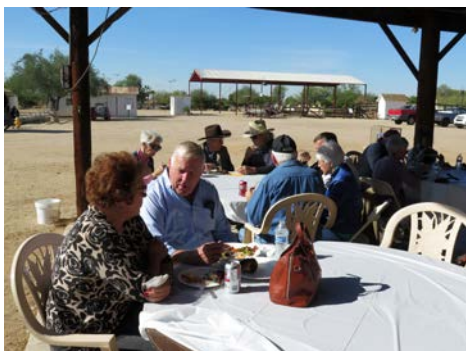
Visit with friends