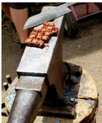
A bit of brownie for everyone.