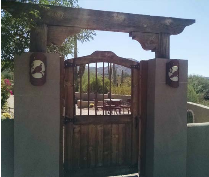
Before Original gate

Paul Diefenderfer Photos: Paul Diefenderfer