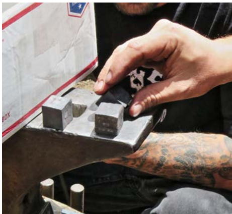
Some of the good cubes.