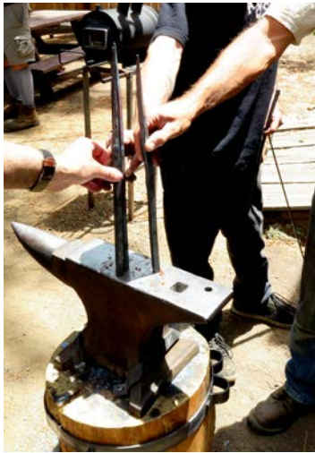
Comparing the drawn-out rods.