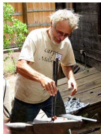
Dief practiced his skill with steel chop sticks.