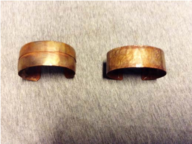
Copper bracelets made by folding very thin material

Maurice Hamburger Photos: Maurice Hamburger