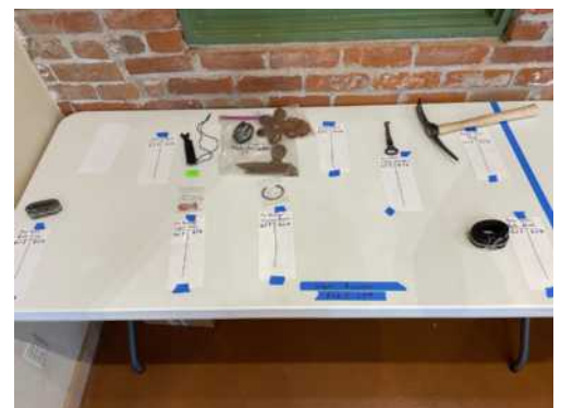
Silent auction table - before the bidding started