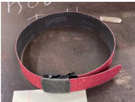
Belt by Moe Hamburger As Moe described things: "Trying to find a way to repurpose used sanding belts? A 40-grit, quality belt, 2"x72" cut to width desired, could make a 60+" belt. Make your own buckle. You may want to strike a match or polish fingernails."

Some of the items brought for Show and Tell at the November demonstration