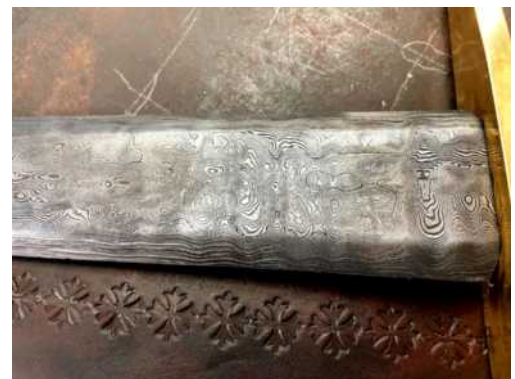
Close-up of the pattern in Tom Selby's sword