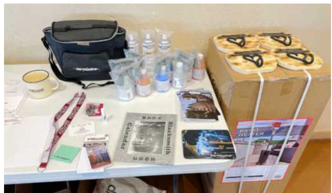
Some of the vendors' donations