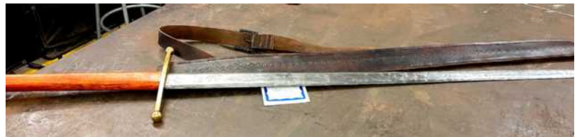
Sword and sheath by Tom Selby