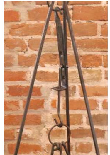
Detail of Matt's trammel