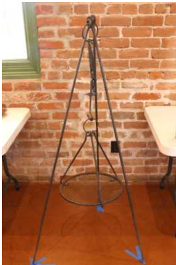
Camping tripod with trammel and pot grill made by Matt Marzolf for the September 2020 AABA demonstration