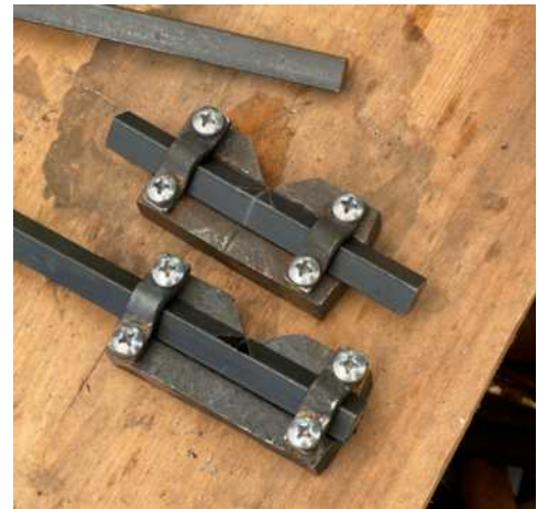
Cutting jigs with bars in place ready the saw..