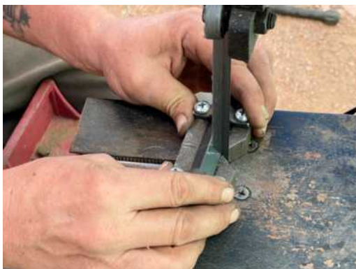
Cutting bars on the band saw.