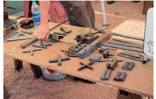
The array of examples, tools, and jigs that our demonstrators used.