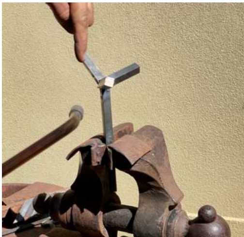
Both bars are fitted together at their cuts, heated with a torch, and bent back until each one is more or less straight.