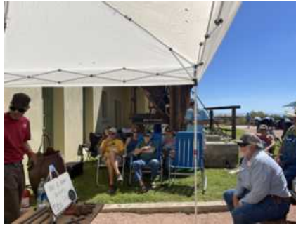
Audience members who were lucky enough to get spots in the shade.