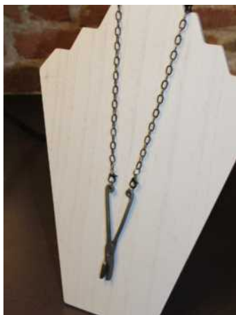
The Anvil's Horn