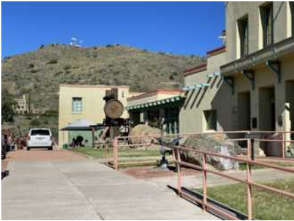
The Douglas mansion The demo was back where the SUV is.