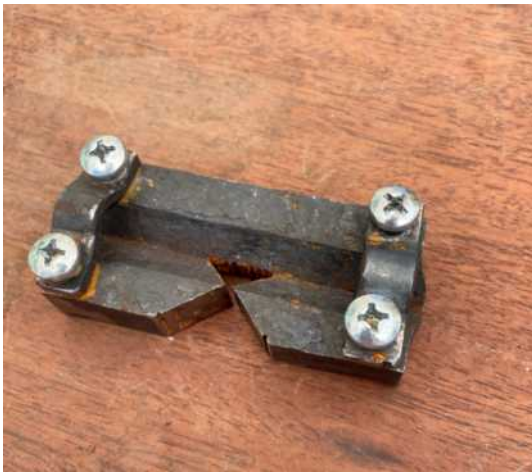
One of the cutting jigs