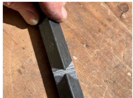
The finished cut