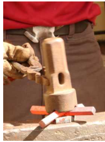
Final adjustment to get both bars into the same plane.