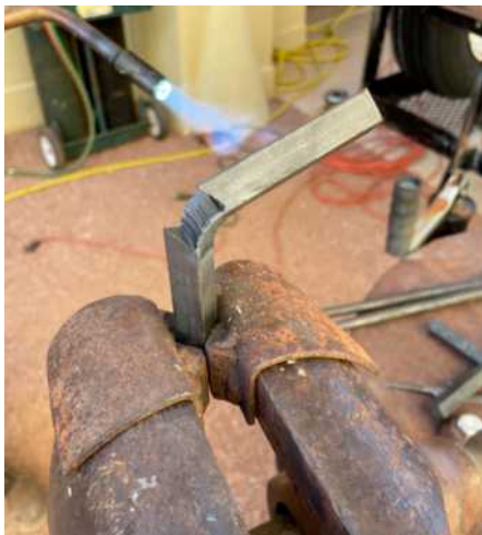
Both bars are heated with a torch and bent back to about 90 degrees.