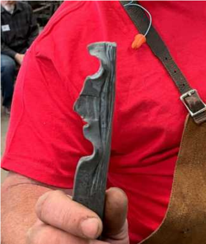
Small model of The Old Man

Dennis' workshop on Sunday, November 20, got involved students involved forging a kinetic sculpture based on work by Pavel Tasovský.