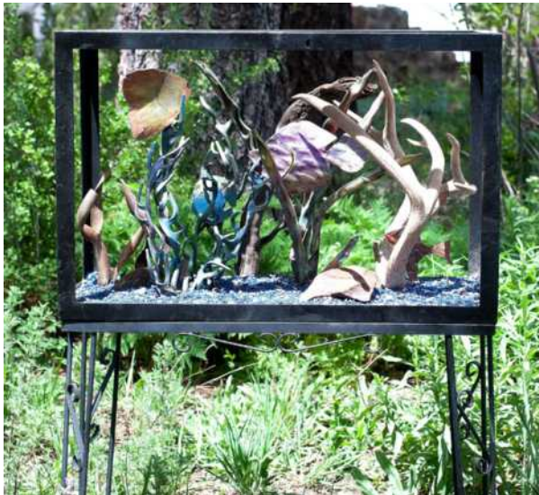
Large Fish Tank Ire Wiesenfeld