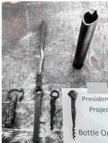
Some of the bottle openers made for the President's Project for November.