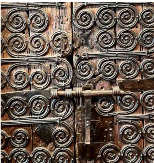
Reinforced door and lock, Catalonia, 13th Century