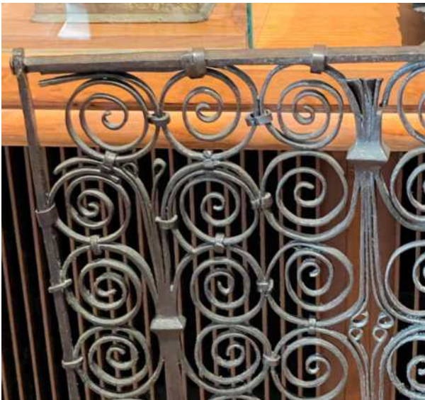
Medieval window grating, Catalonia, 15th Century