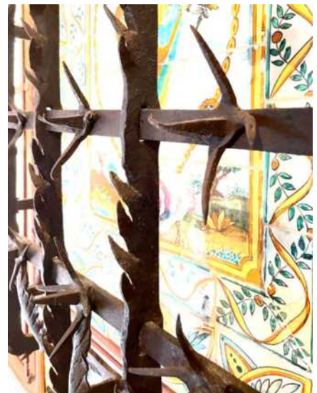
Window grating. Castile, 18th Century.