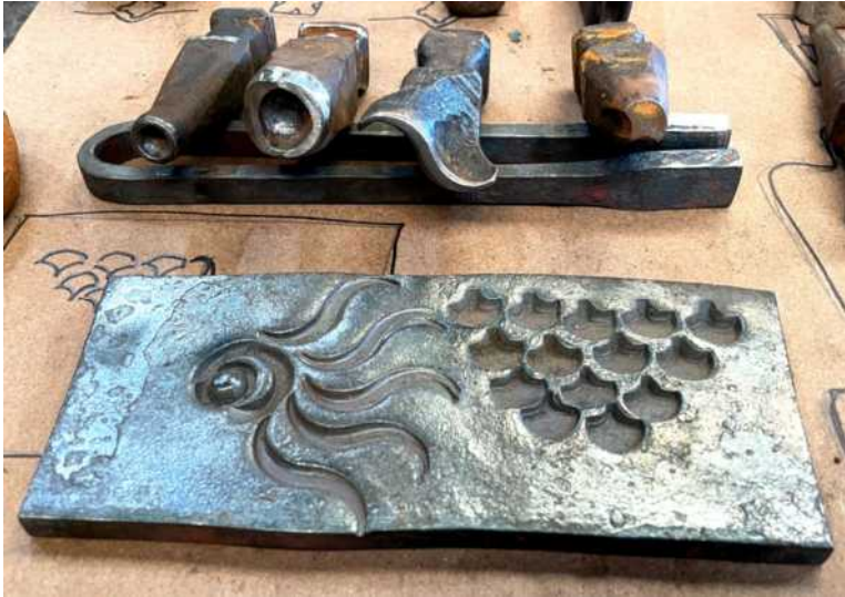
Punches used to create art