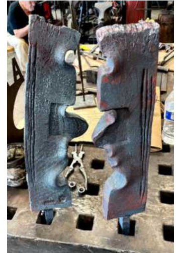
Final product. Two Old Men