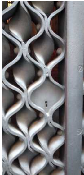
Entrance at Palau Güell in Barcelona, Spain, with detail of the central grille