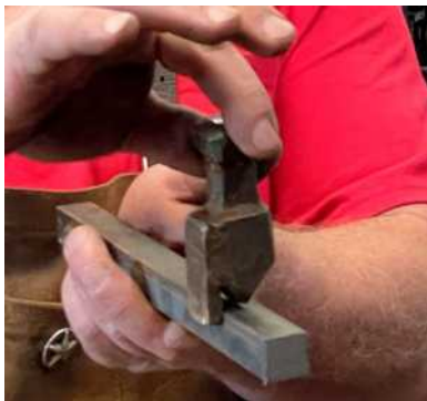
A shop-made tool to create a groove in the center of the bar.