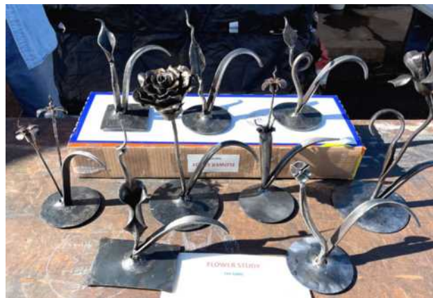
Show and Tell Flower study by Len Ledet.