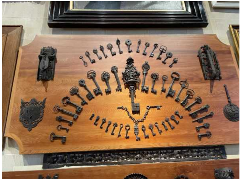
Keys, from simple to ornate.