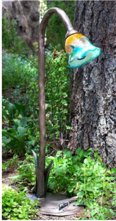
Flower Light #1 Cathi Borthwick