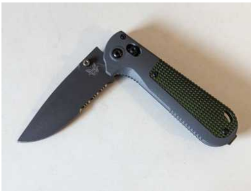
The knife donated by EK Knives.