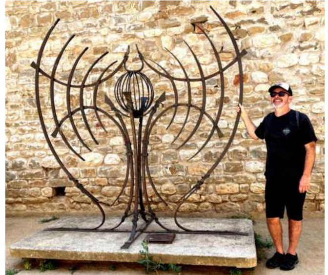
Forged radio waves, a tribute to 30 years of Radio Besalú done at the blacksmith festival in Besalú, Spain, in 2015.