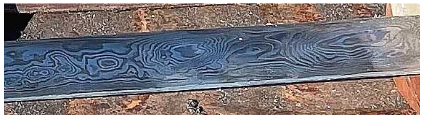
Show and Tell Damascus sword by Tom Selby