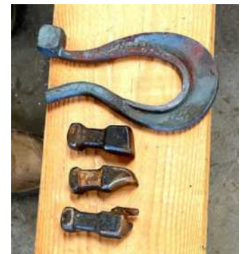
Tools used to create an artistic element.