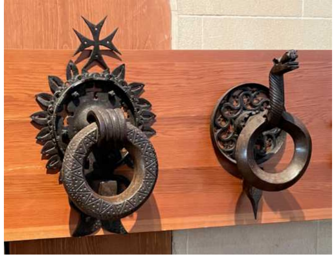
Door knockers, Catalonia. 15th - 16th Century