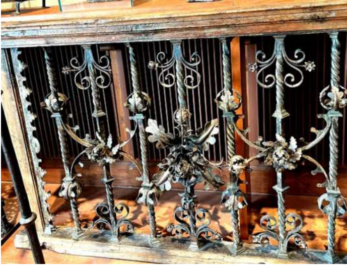
Balcony railing, Catalonia. 18th Century.

Examples from the collection in the Cau Ferrat Museum in Stiges, Spain