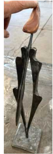
Students worked to make sculptures like the example Dennis brought for the workshop on Sunday.