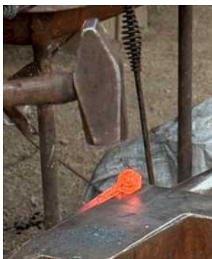
Creating a ball finial. Start with a large rod and draw out a thin stem