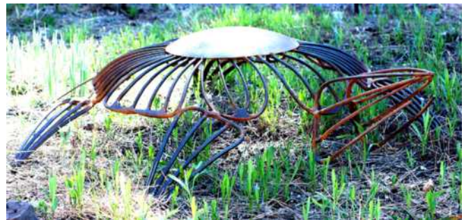
Pitchfork Turtle Ira Wiesenfeld