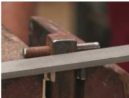
Filing rectangular tenons for final fit.