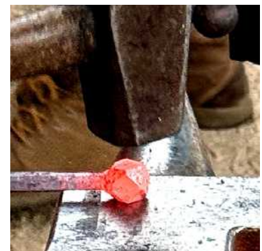
Finish the geodesic shape on the top of the lump.