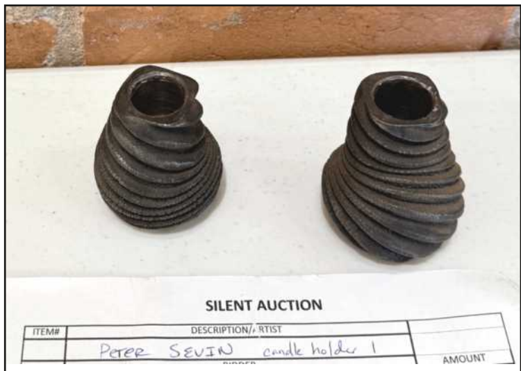
Candle holders by Peter Sevin One of the items in the silent auction