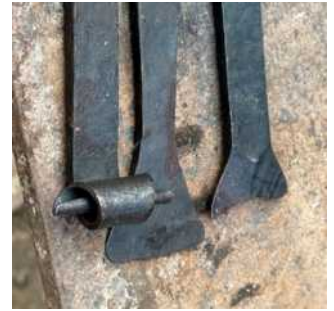
Fish-tail scrol with intermediate steps.