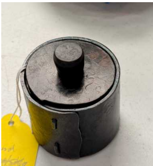
Container by Mo Hamburger One of the auction items.