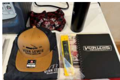
Items donated by Vern Lewis Welding Supply