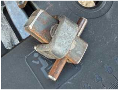
Using rare-earth magnets to hold collars in place while shaping them.