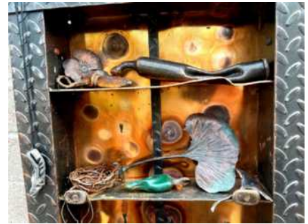
Forged steel, diamond plate, copper and aluminum. 20"x5"x36"h, October 2025.