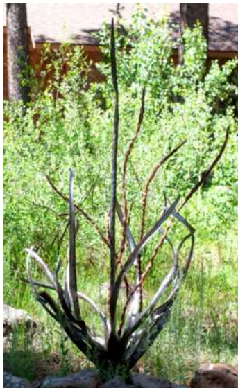
Octopus Ira Wiesenfeld