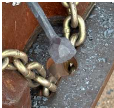
Start to create a geodesic shape on the bottom of the lump on the end.