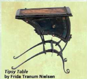
Topsy Table by Frida Tranum Nielsen